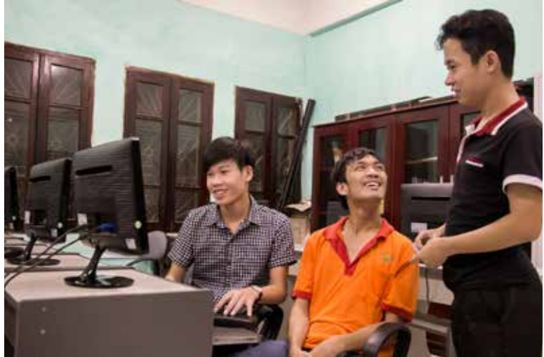
These young men are participating in a distance-learning course to gain marketable IT skills.