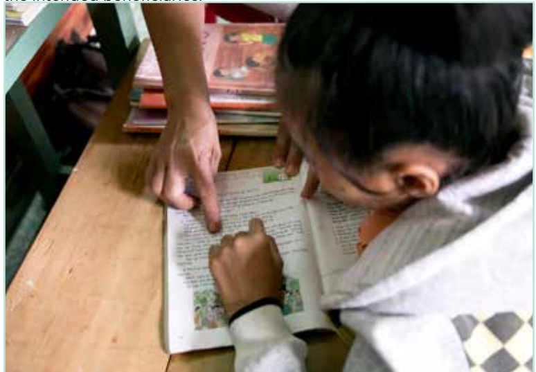
With home-based education support, a young girl practices reading. Her physical disabilities do not keep her from her schooling.

To foster full inclusion of people with disabilities, the Government of Vietnam established a strong national policy foundation in 2010 to guarantee equal and equitable rights, access, and inclusion of all citizens. These policies are essential to full inclusion; however, the legal structure was neither widely understood nor optimally leveraged by the intended beneficiaries.