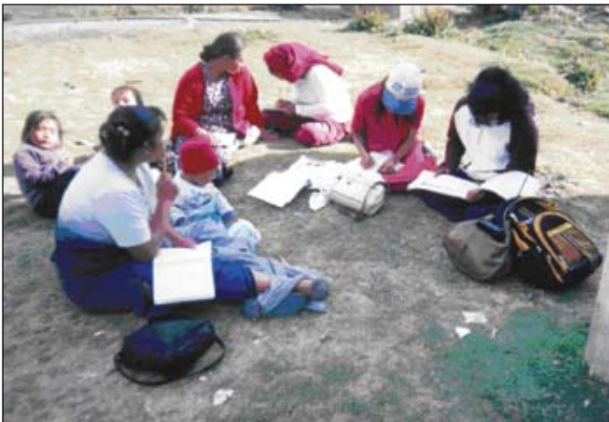
Literacy Group, Post Literacy phase, Tacaná, San Marcos