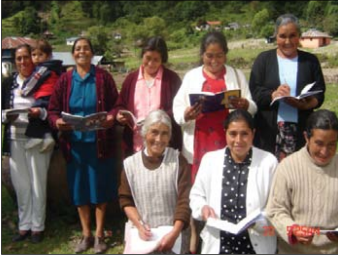
Literacy groups facilitated by two adolescents who receive a scholarship in San José Ojetenam, San Marcos