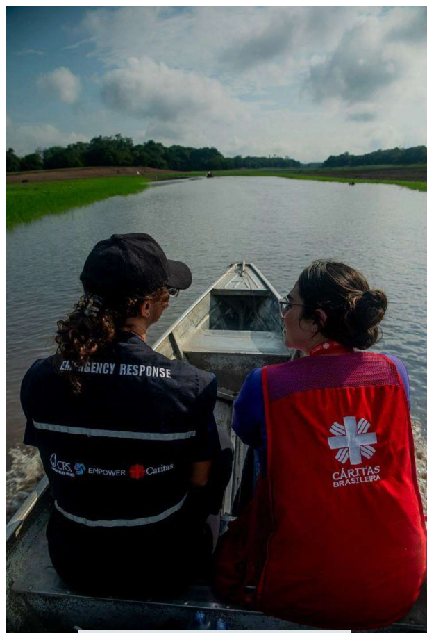
CRS EMPOWER and Caritas Brasileira responding to the historic Amazon drought of 2023 in communities completely cut off from basic services.

Since its inception, EMPOWER has demonstrated strong results and the ability to scale up. EMPOWER LAC programs are now partially funded by USAID's Bureau of Humanitarian Assistance , and EMPOWER has expanded beyond the LAC region to support partner organizations in West Africa and parts of Asia . Current donors include BHA, the ELMA Caribbean Foundation, and the Arthur M. Blank Foundation.